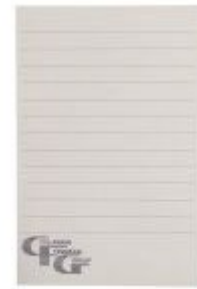
25 Sheet Notepad