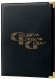
The Miamian Portfolio

Columbian Financial Group branded merchandise such as apparel, golf items, mugs, coasters, pens and much more are available at low prices through the online CFG Company Store . Call Sales & Marketing at extension 6255 if you have questions.